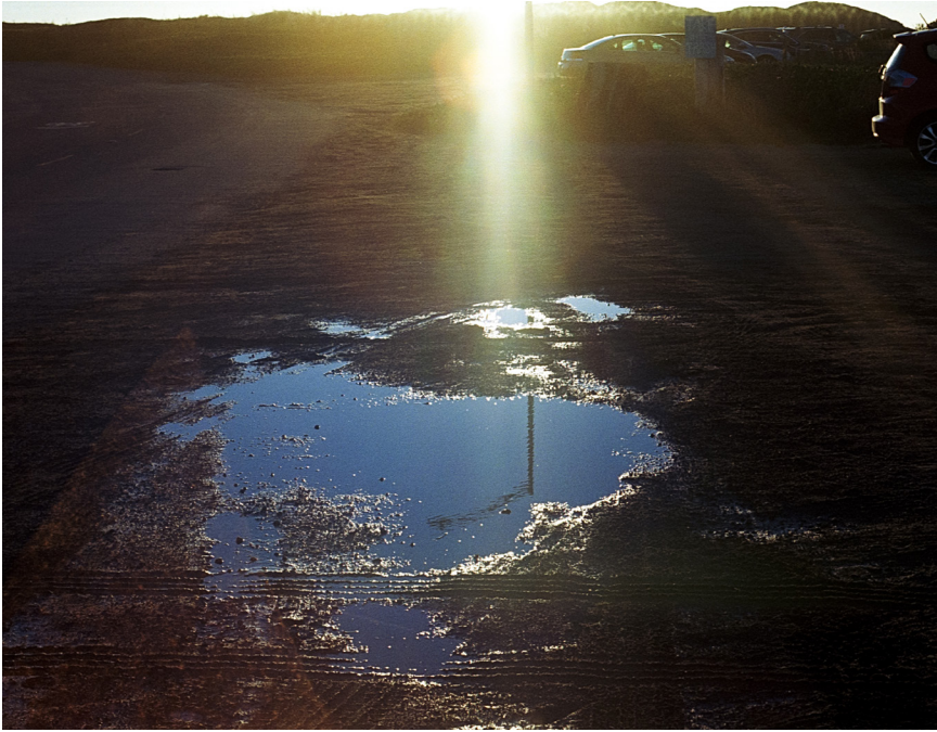
Kodak ProImage ISO 100 Yashica TL-Super, Asahi Super-Takumar 55mm f /1.8