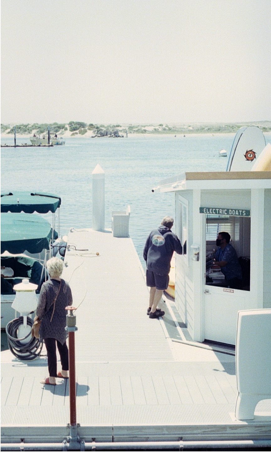
Kodak Gold ISO 200 Minolta SR-T 101, MD 50mm f/2