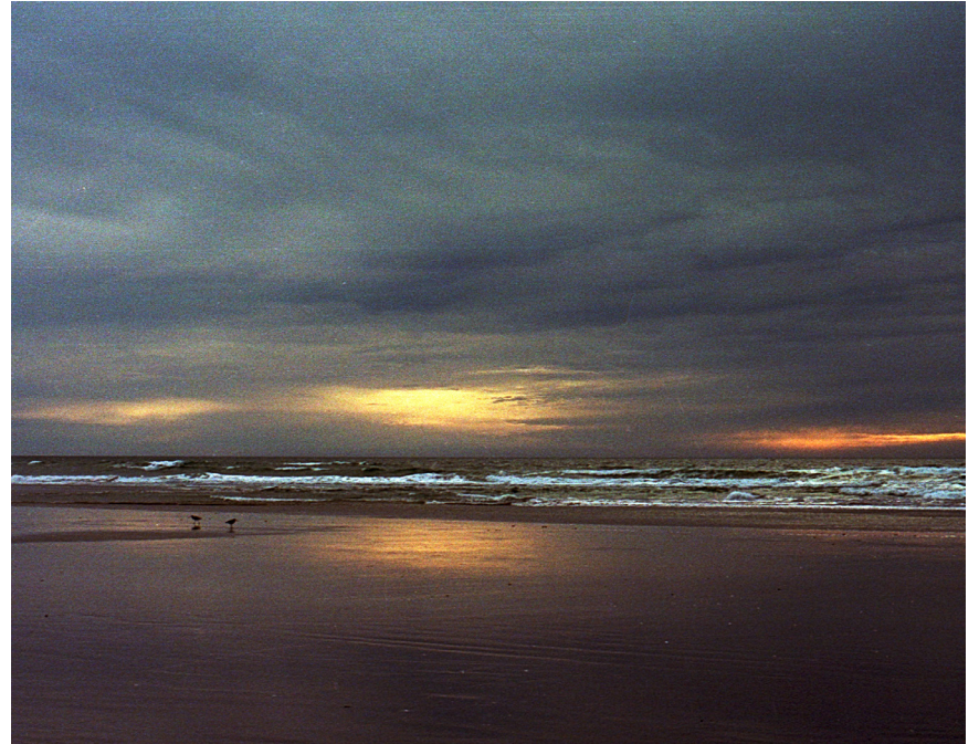
Kodak Professional Portra ISO 160 Yashica TL-Super, Asahi Super-Takumar 55mm f /1.8